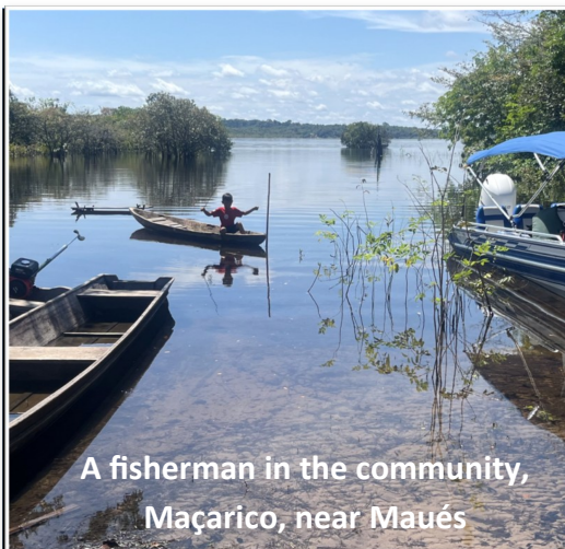
A fisherman in the community, Maçarico, near Maués