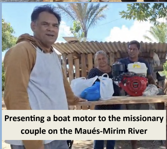
Presenting a boat motor to the missionary couple on the Maués-Mirim River