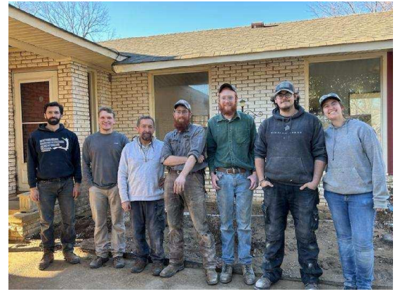
Above: The first weekend of February, I went to western North Carolina and helped work on a home that had been flooded during Hurricane Helene. We sanded sheetrock and installed flooring for the home. The crew after us will do texture, paint, and trim, then the home will be ready for the owners to move back.