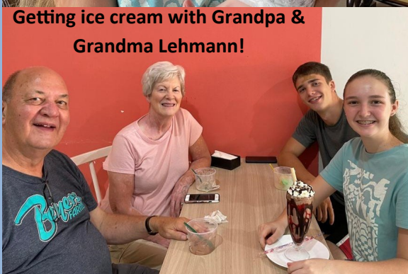
Getting ice cream with Grandpa & Grandma Lehmann!